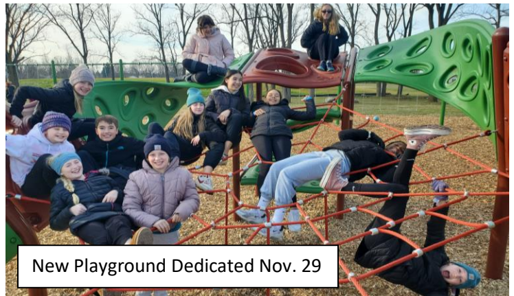
New Playground Dedicated Nov. 29