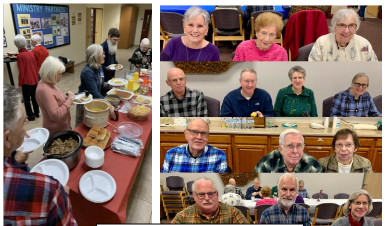
Food Bank Volunteer Luncheon

OSL members may donate both food and household items at the bin in the church lobby. Monetary donations may be given online or at church.