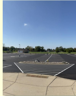
Parking Lot Dedication