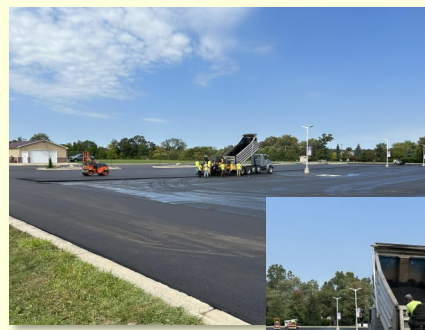
Parking Lot Construction