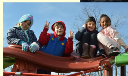
Fun on the new Playground