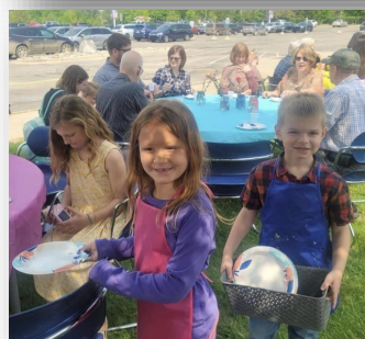
Early Childhood I Love You Tea