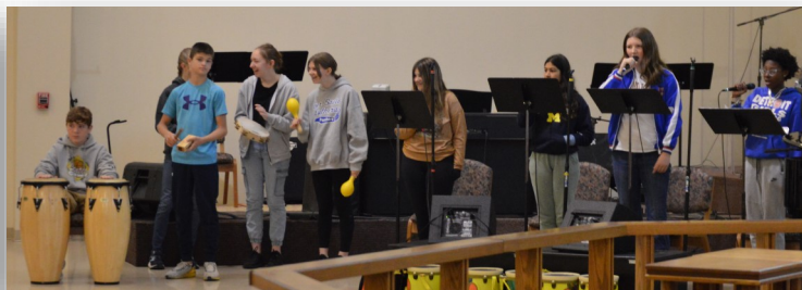
Students leading chapel through message and song