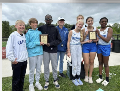
Regional Track Meet