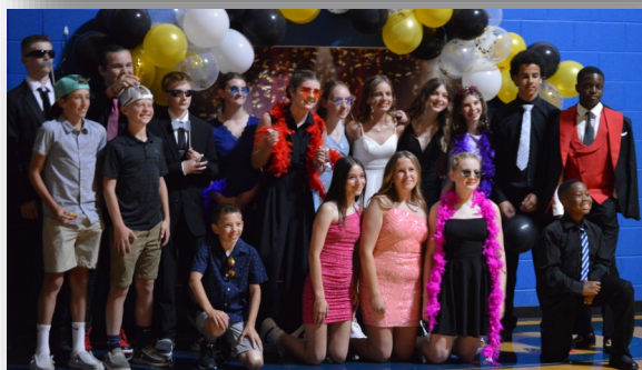
Middle School Spring Dance