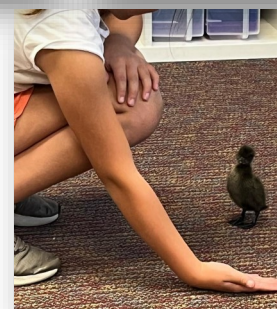
2nd Grade Duck Hatchling