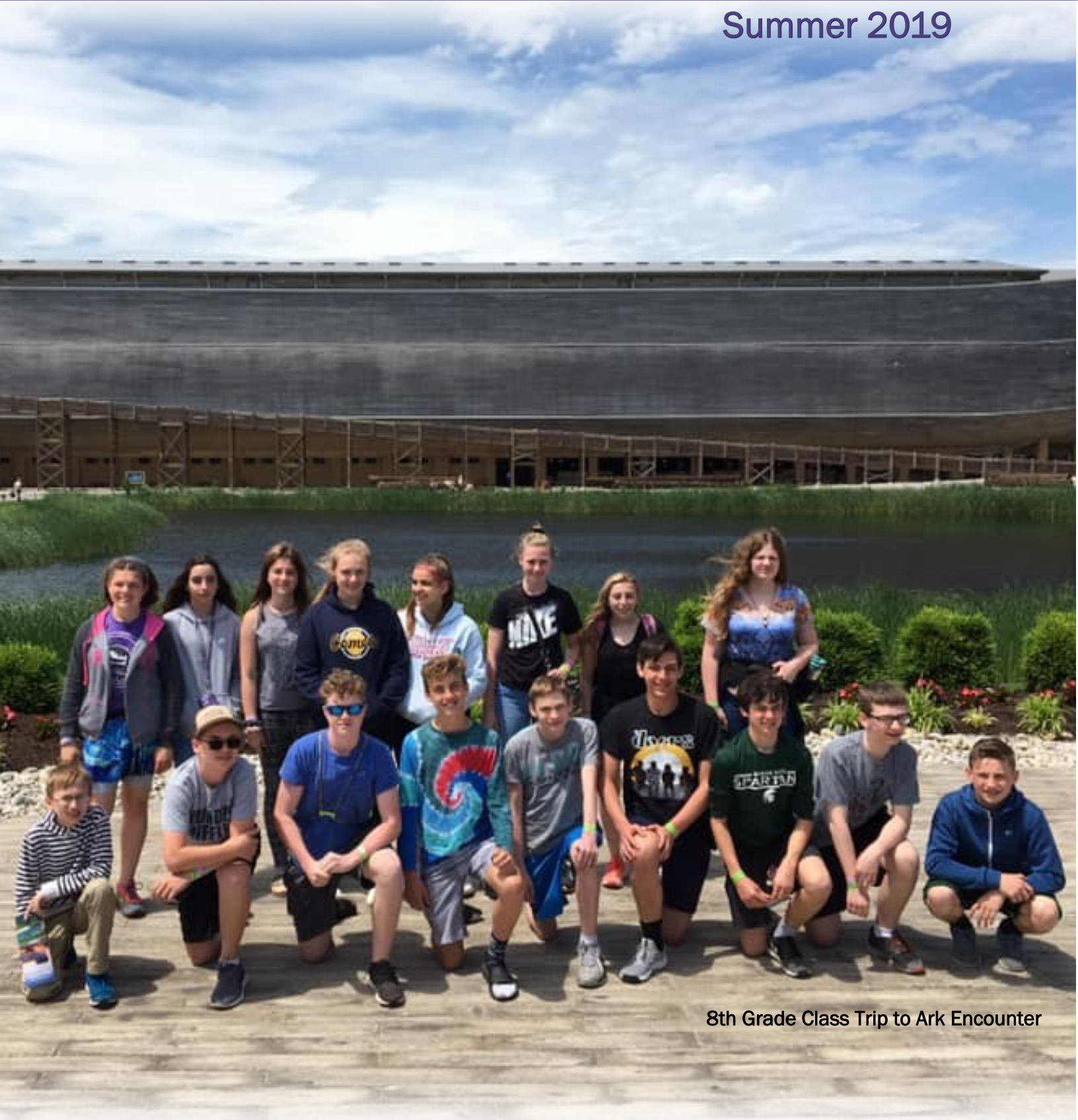
8th Grade Class Trip to Ark Encounter

Our Savior Lutheran Church and School Quarterly Newsletter